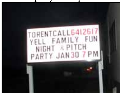
Sign next to Lodge 389 Saline Center Lodge hall advertising recruitment event

Starting right away in January, Lodge No. 389 Saline Center, along with their YELL! group, hosted a recruitment party called the “YELL! Family Fun Night” at their lodge hall. They used the YELL! recruitment fund to off set costs including purchasing small games like checkers and juice boxes for the kids.