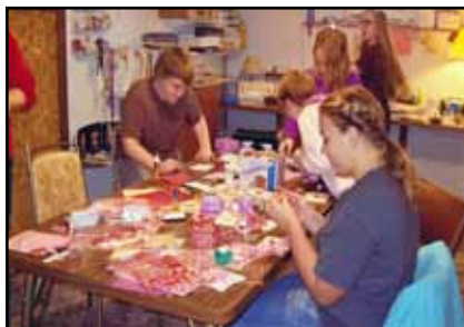
YELL! group 192 making 125 Valentine's day cards for Meals on Wheels.