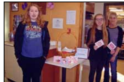
YELL! group members delivering the homemade cards to Meals on Wheels.